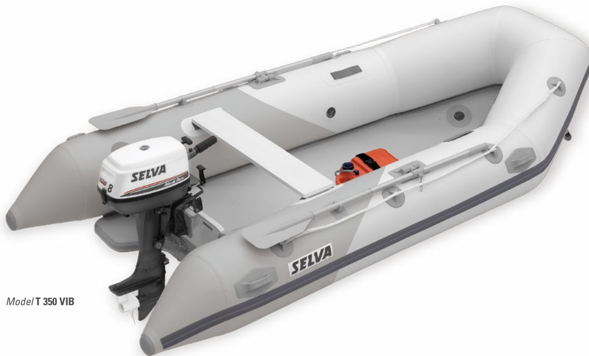
Model T 350 VIB