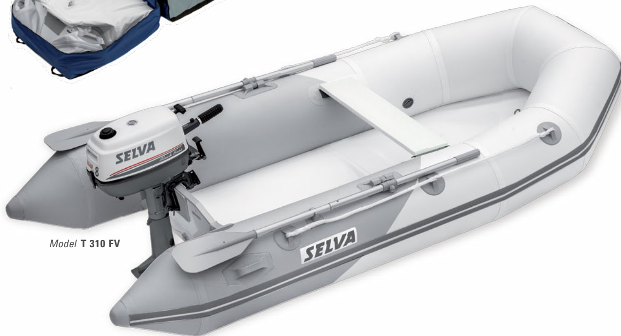
Model T 310 FV