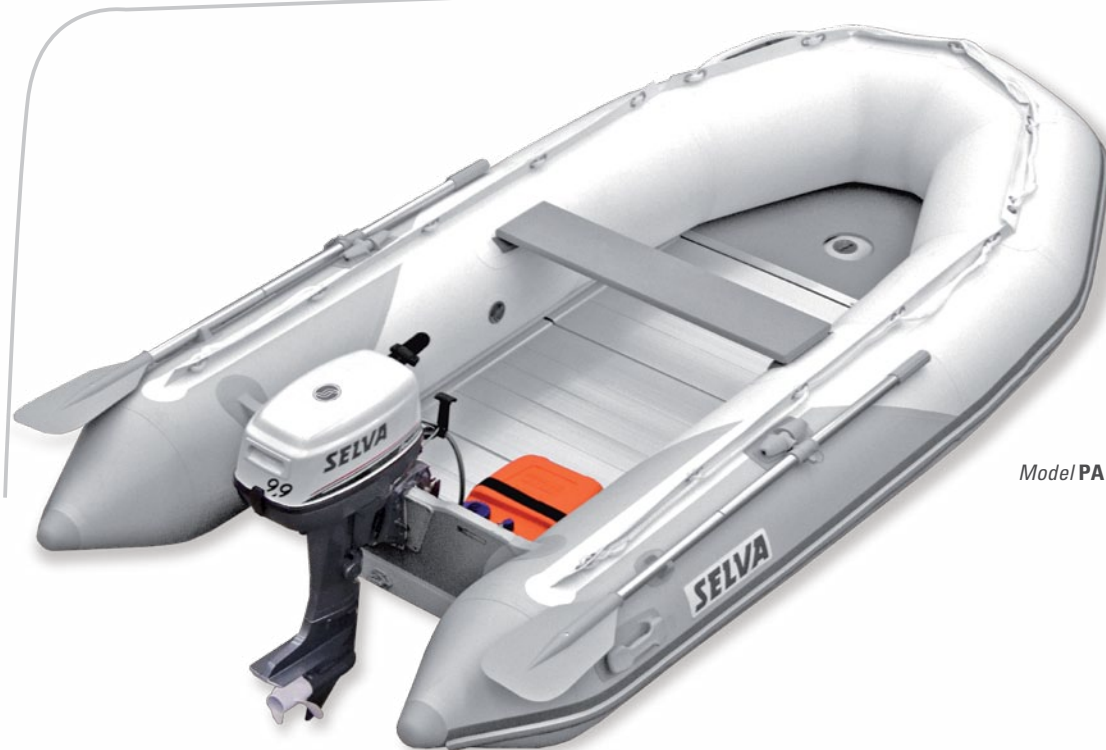
Model PA 320 ALU