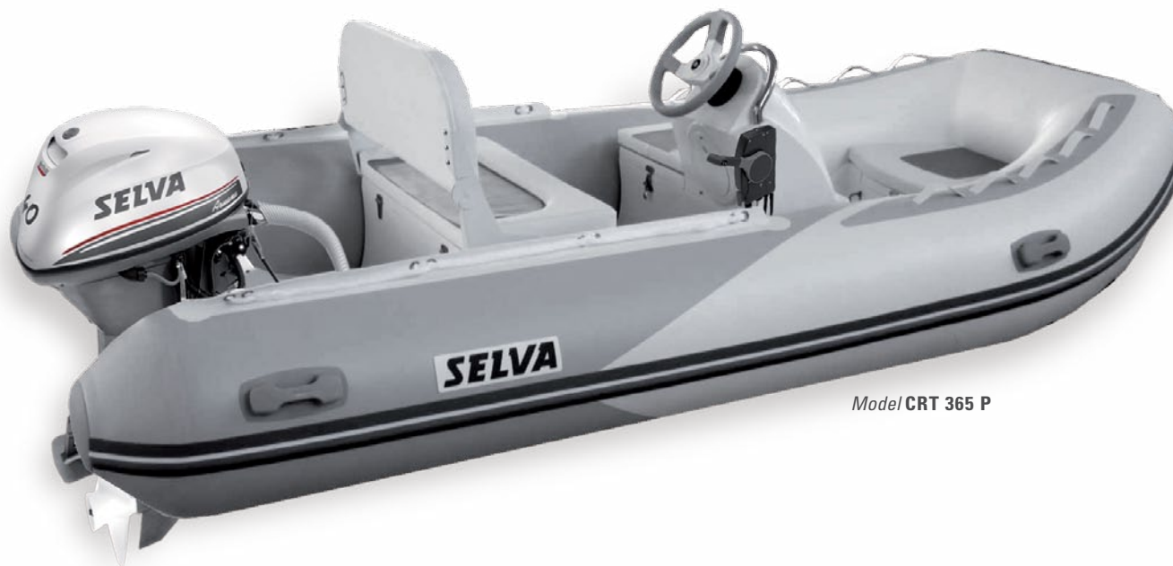
Model CRT 365 P