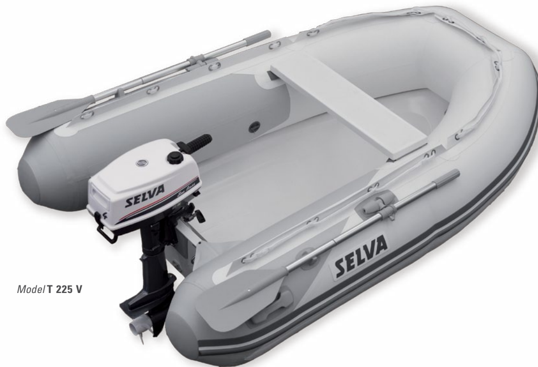
Model T 225 V