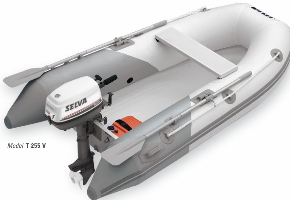
Model T 255 V