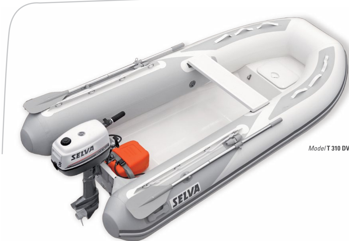
Model/T 310 DV