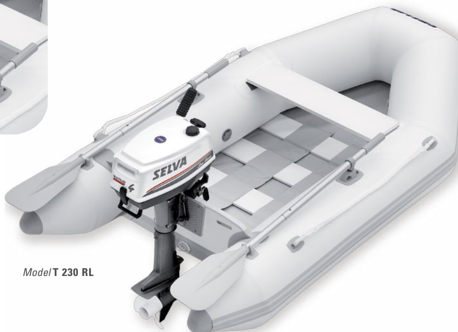
Model T 230 RL