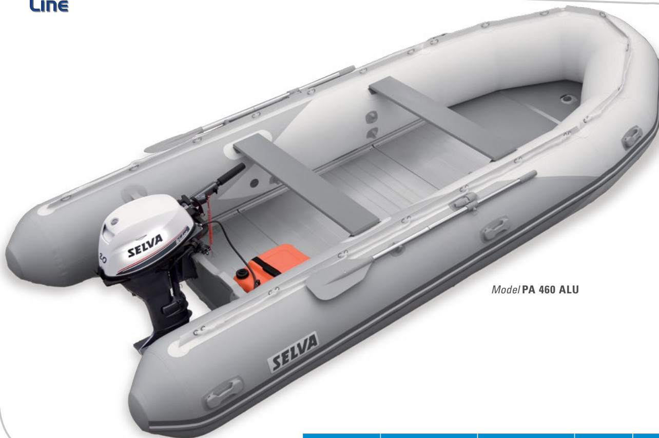
Model PA 460 ALU